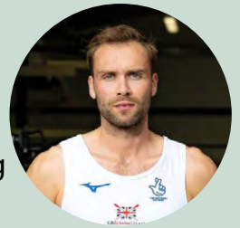
Ollie Wynne-Griffith Blue Boat 2022 | Olympic Bronze Medallist, Tokyo 2020 | Peterhouse

“World-class facilities, equipment and coaching enable hard, consistent training to translate into even more boat speed. It is these elements that often separate gold medallists from the rest of the field. Ours is a sport where races are decided by the fractions of seconds that we find both on and off the water.”